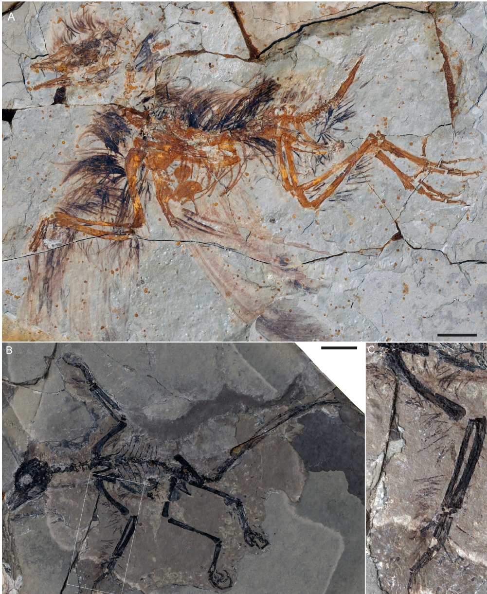
Fig. 6 Juvenile enantiornithines preserving possible immature feathers

solid appearance along the proximal two-thirds of their length. These tail feathers are poorly preserved but barbs appear to be visible along the distal third. The unusual preservation and curved appearance of these RDFs may suggest they are immature.