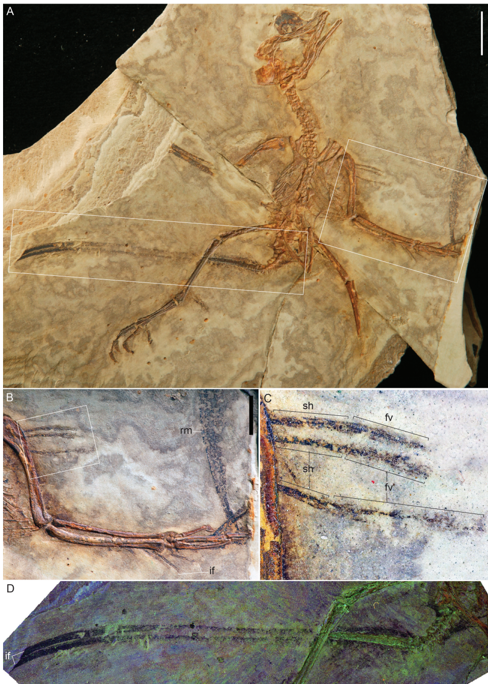
Fig. 5 Juvenile enantiornithine IVPP V 15564 preserving probable immature feathers

A. slab A; B. left forelimb (enlarged from boxed region indicated in A);