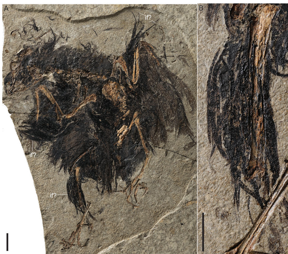
Fig. 7 Unusual feathers in Cruralispennia IVPP V 21711 A. photograph of the full slab; B. close up of the unusual feathers on the tibiotarsus Scale bar in A equals 1 cm; scale bar in B equals 5 mm. Abbreviations see Fig. 4