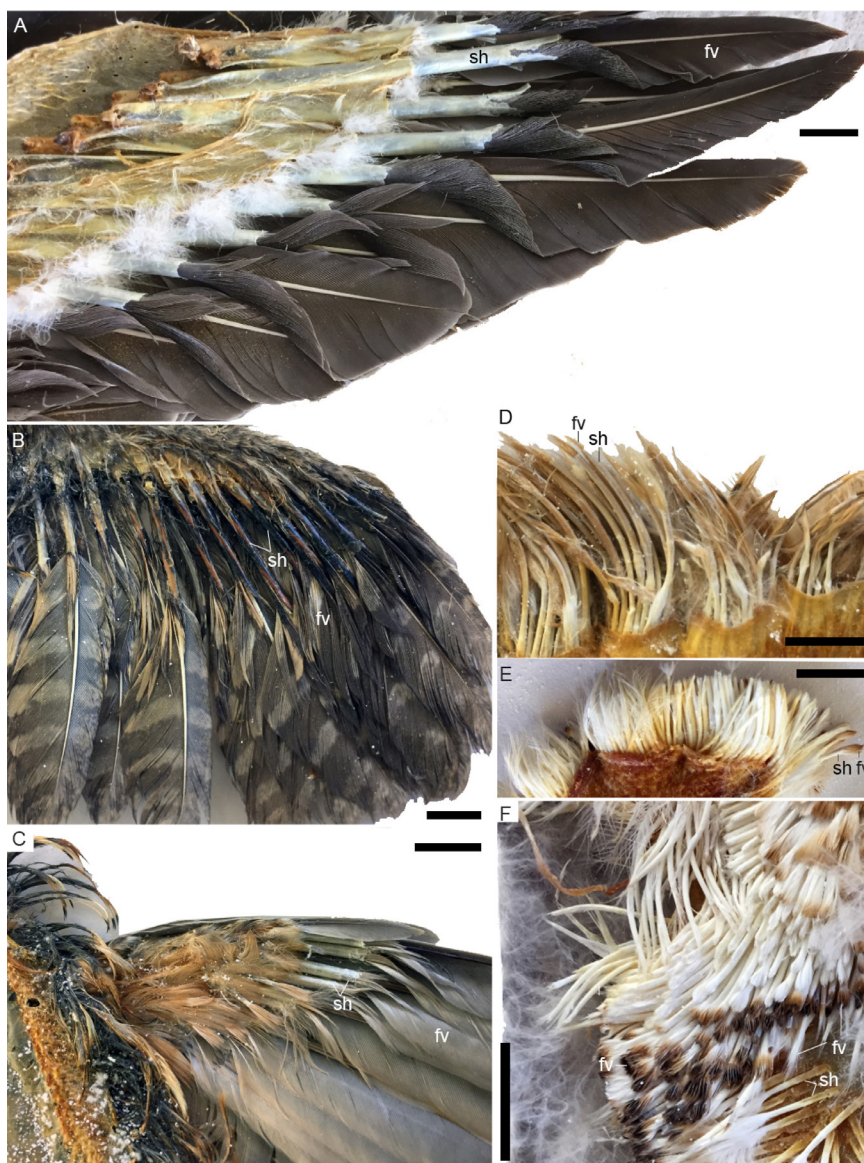
Fig. 1 Immature feathers in juvenile neornithines

Feather emergence has not been convincingly documented in any avian specimen from the rich Jehol Biota. However, immature feathers have been proposed to be present