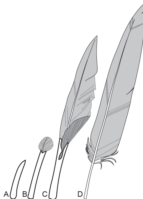
Fig. 2 Illustration of the stages in feather development

Recently, integumentary data from the Jehol Lagerstätte is being supplemented by skeletal specimens with associated soft tissue three-dimensionally preserved in Cenomanian